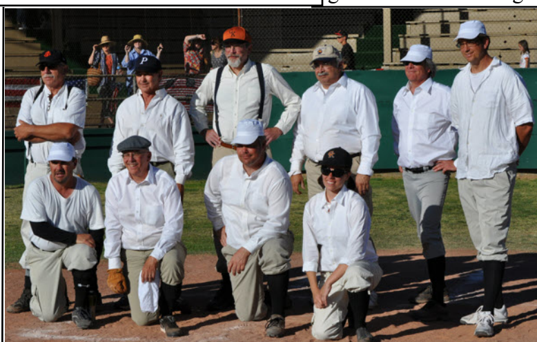
The Bisbee Black Sox vintage team played their first-ever game Sunday, losing to a Fort Huachuca Army team 18-14.